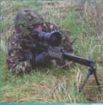
MAXI-KITE MK 2 fitted to LSW 5.56mm